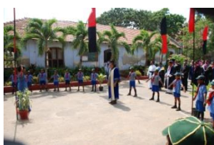
Cub Scouts' Grand Howl