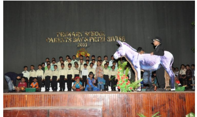
The Action Song “An Old Man and the Donkey” being performed at the Parents' Day

Tennis (Red & Orange), Chess and Athletic Skills are taught to students, and Cub Scouting is introduced from Grade 1.