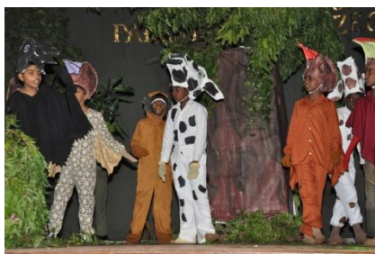
A Drama by Gr. 5 Students